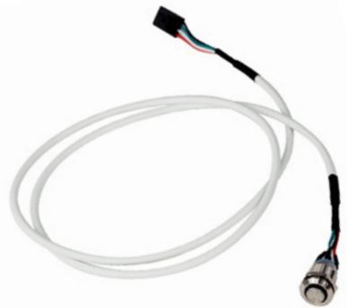
Included with every unit of the BSL06M5